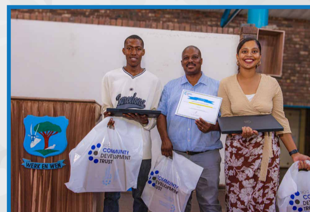
Handover of laptops to learners at Deben Laerskool