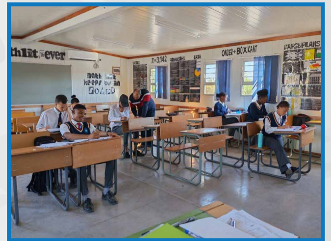
Learners participating in the SIOC-CDT Matric Support Programme focused on Mathematics and Science