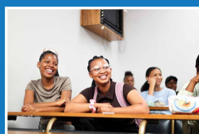
Welcoming of the SciMathUS cohort at Stellenbosch University