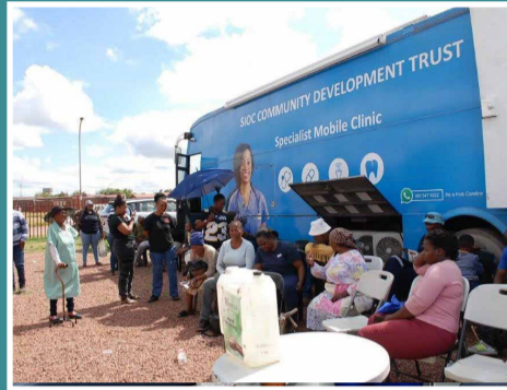
Rea Fola Mobile Unit

Through the expansion of this programme by bringing in five (5) new mobiles in 2024, the Trust has already conducted more than 75 369 comprehensive healthscreenings across its